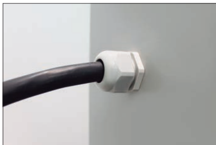
Os Prensa Cabos garantem a segurança e a integridade das conexões.